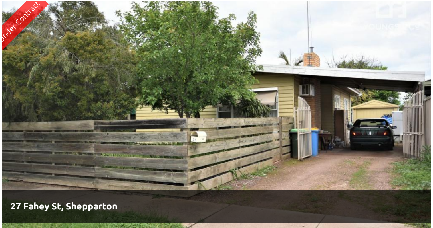
27 Fahey St, Shepparton