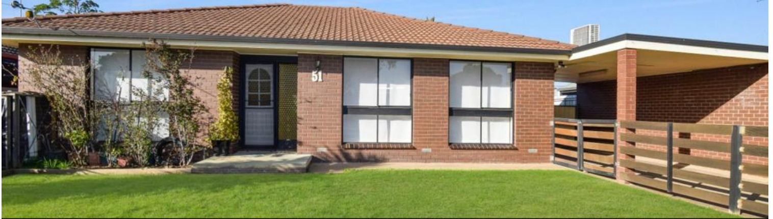
51 Lenne St, Mooroopna