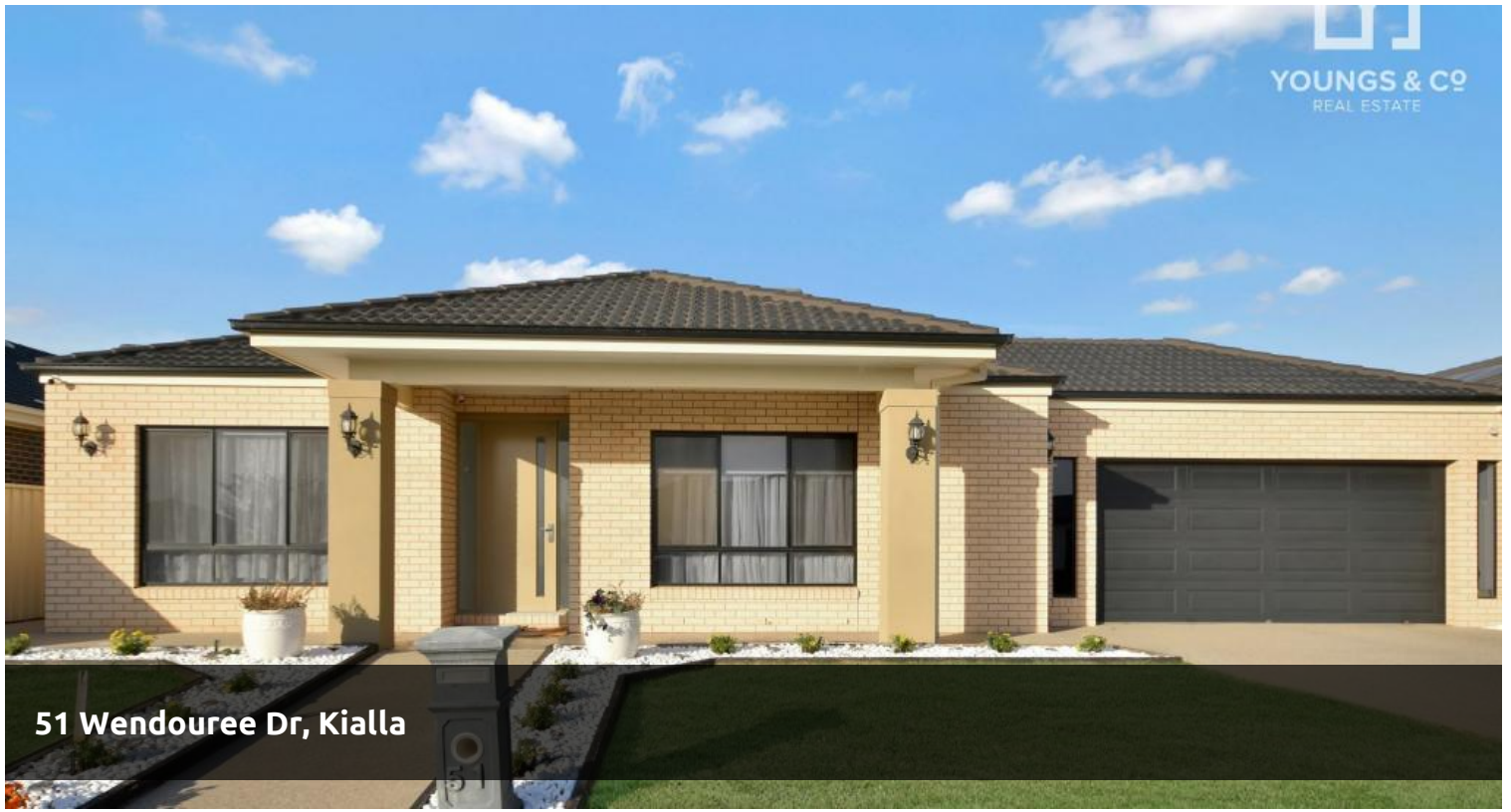
51 Wendouree Dr, Kialla