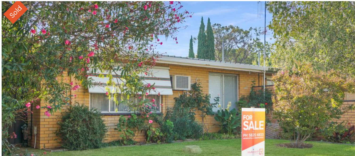
Unit 3, 16 Elizabeth St, Mooroopna