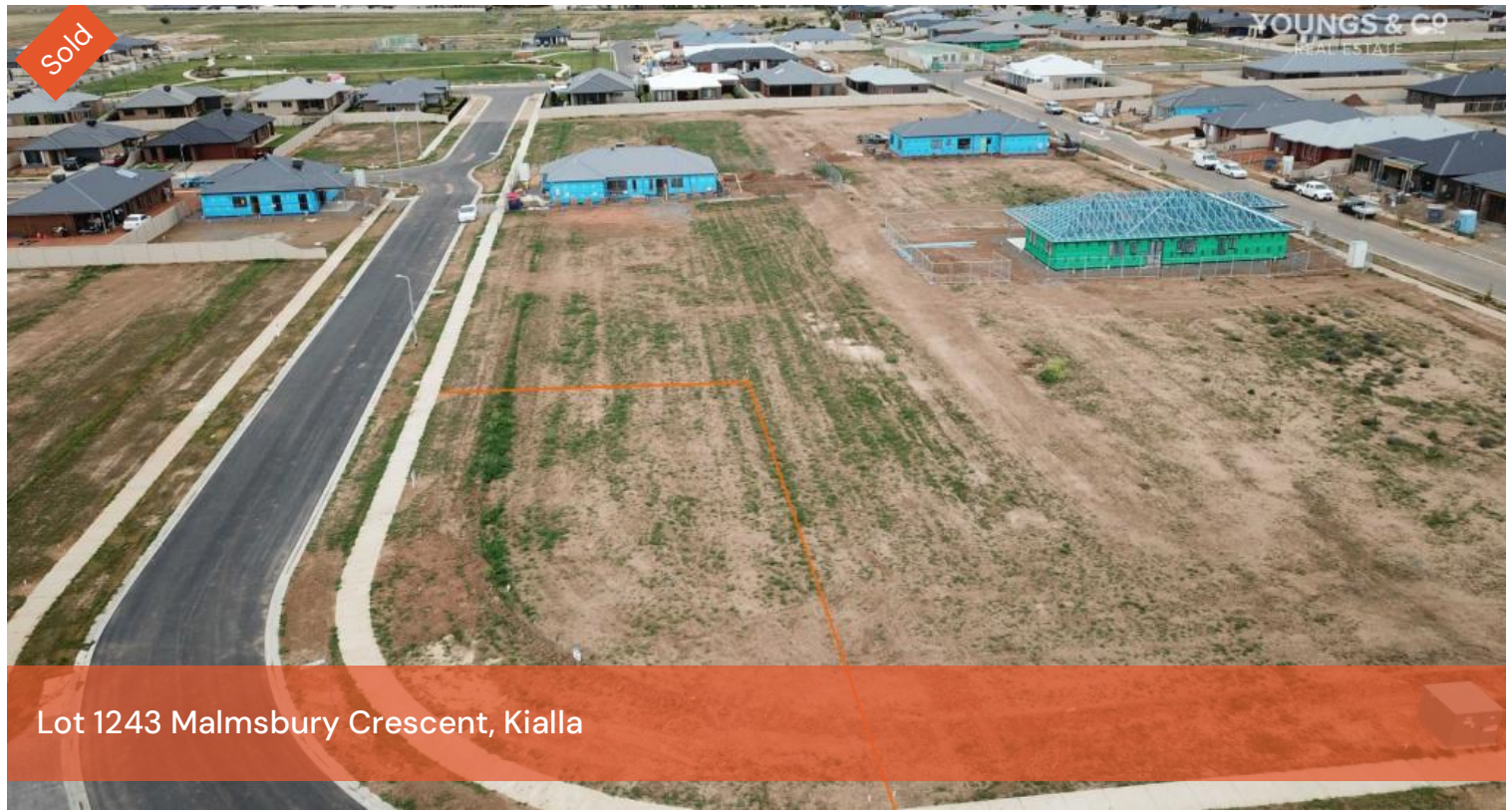
Lot 1243 Malmsbury Crescent, Kialla